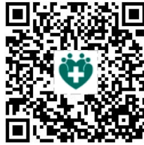
Special webpage against Epidemics